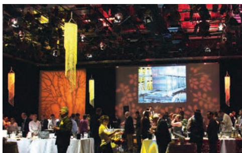
WGBH'S CALDERWOOD STUDIO WAS TRANSFORMED INTO A FESTIVE HOTSPOT FOR THE FOOD AND WINE FESTIVAL